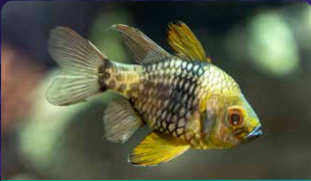
Pajama Cardinal Fish (Sphaeramia nematoptera)